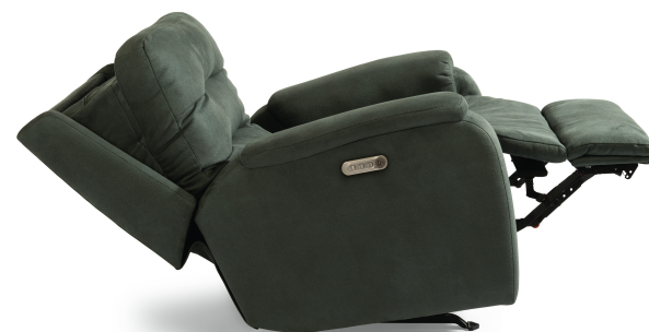
2810-51L in fabric 407-30