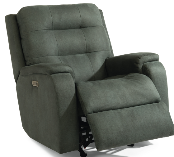
2810-51L in 407-30