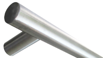
Designer Style Handle Included