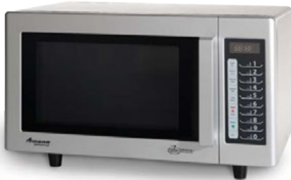
Model RMS10T and RMS10TS shown